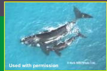
Used with permission